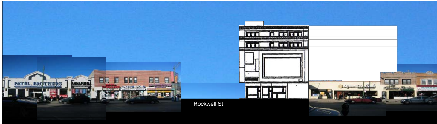
Devon Avenue looking North

CITIZENS FOR RESPONSIBLE DEVELOPMENT A better plan for the 50th Ward